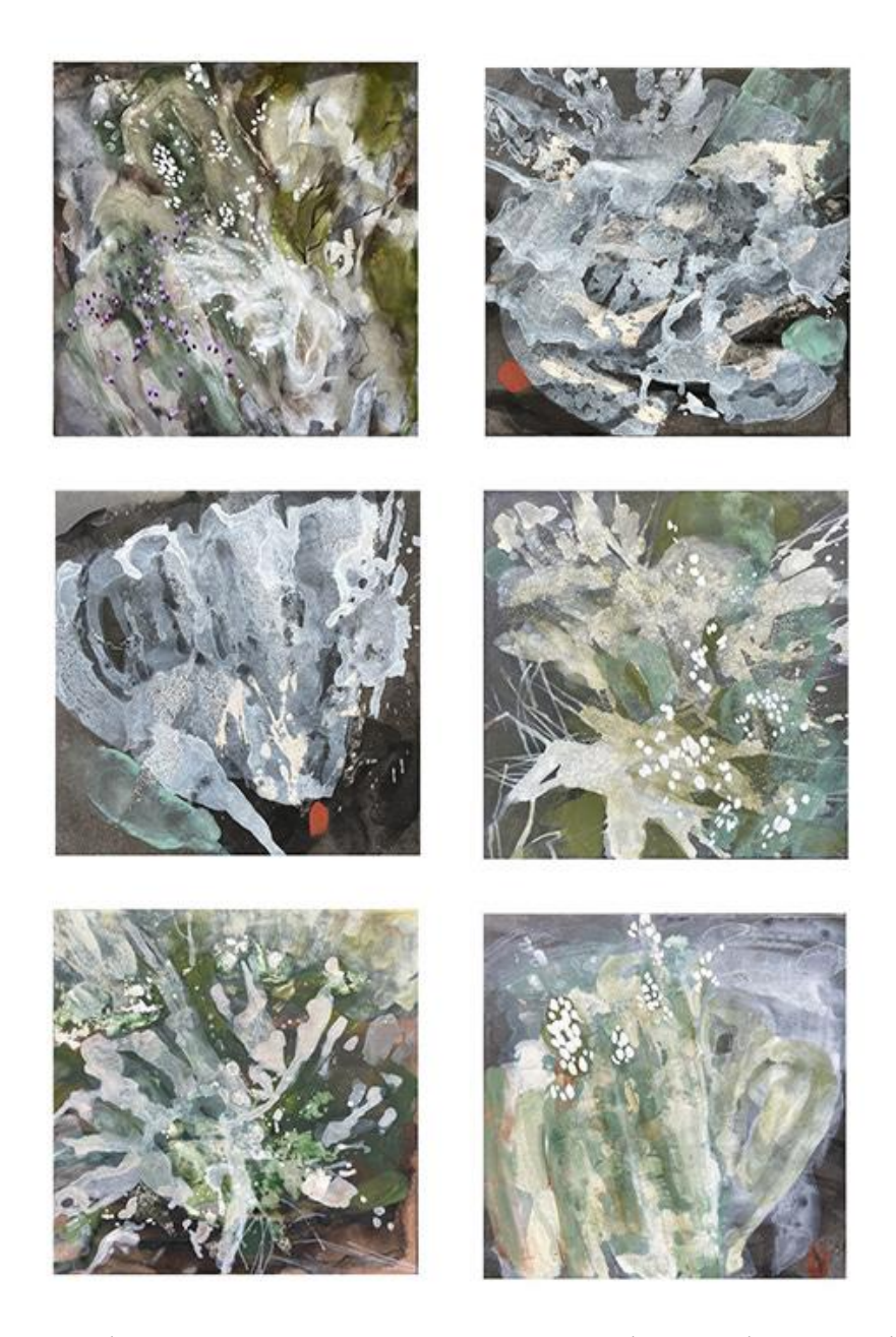
Marvao, Portugal Spring Series 1-6. 12 x 12-inch panels, mixed-media and silver leaf on paper. These images were inspired by her travels in Portugal.